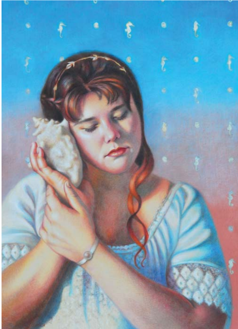
In this drawing I used Prismacolor Premier silver colored pencil to draw the sea horses in the background. The surface is light grey paper but the silver effect still shows up a bit because of the solid colors next to it.